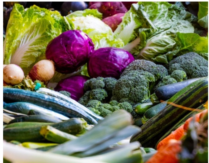
Vegetable seeds and plants available at ufseeds.com