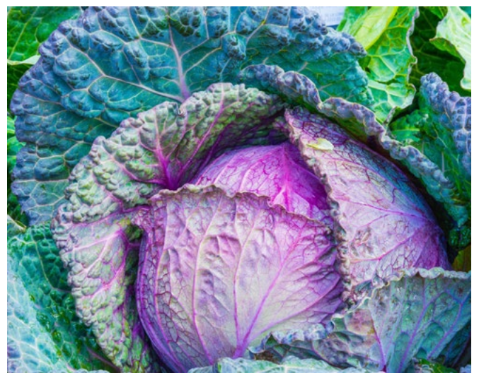
Cabbage seeds available at ufseeds.com

You can find cabbage seeds on our website at ufseeds.com!