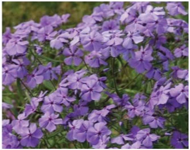
Divaricata Phlox seeds available at ufseeds.com

Check out our Phlox seed selection on our website at ufseeds.com!