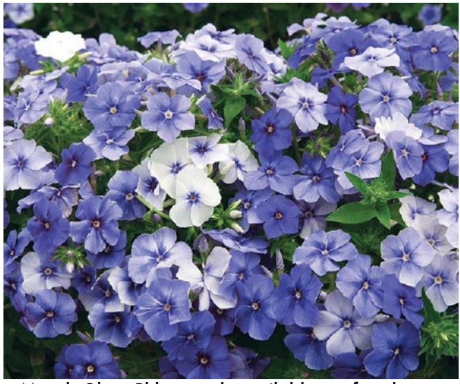
Moody Blues Phlox seeds available at ufseeds.com

Phlox returns year after year because it is a perennial, but division is necessary every few years to produce the healthiest plant. To divide Phlox, dig up the root ball and divide