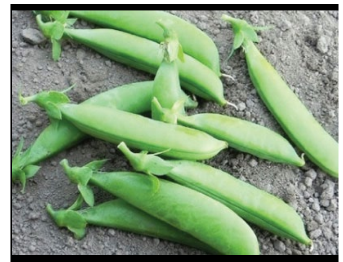
Sugar Sprint Pea seeds available at ufseeds.com

Where to buy pea seeds: Urban Farmer offers many species of pea seeds, from sugar sprint to spring peas. To buy pea seeds, check out our website at ufseeds.com!