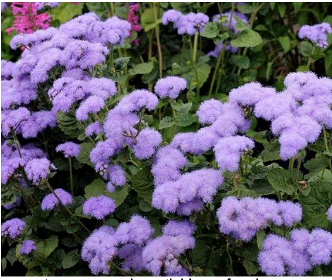
Ageratum seeds available at ufseeds.com

Ageratum grows best in a partially shaded area with well-drained soil. Typically, Ageratum are annual flowers but they sometimes come back as perennials. Be sure to water the flower regularly, at least until the plant becomes established, because this will ensure the plant blooms continually throughout its growing season. When blooming, be sure to deadhead the spent blooms to encourage more blooms to grow. In addition to adding unique colors to your garden, Ageratum brings along a large array of benefits, such as attracting