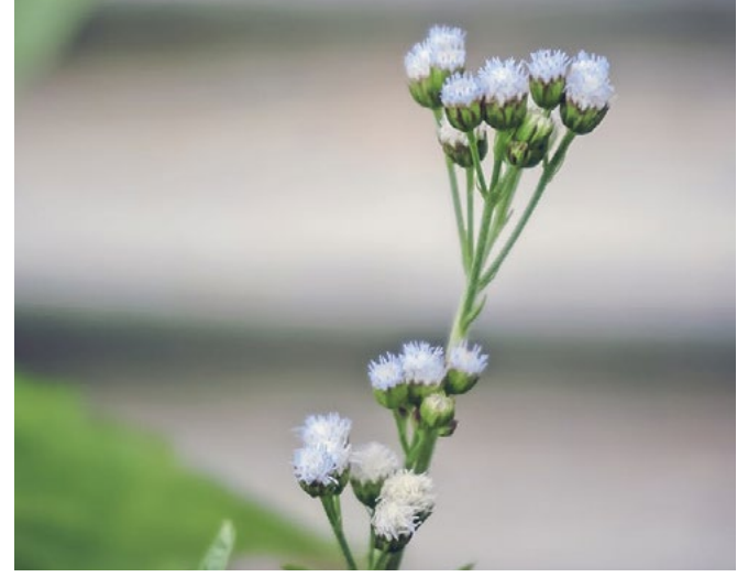
Ageratum seeds available at ufseeds.com

Find Ageratum seeds on our website at ufseeds.com!