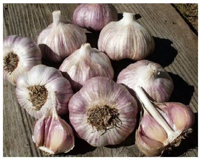
Garlic bulbs available at ufseeds.com

You can find garlic bulbs on our website at ufseeds.com!