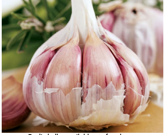
Garlic bulbs available at ufseeds.com

Thrips will create discolored leaves and scarring, and affected garlic plants may look silver in color. To prevent this, don't plant garlic or onion-related plants near grain