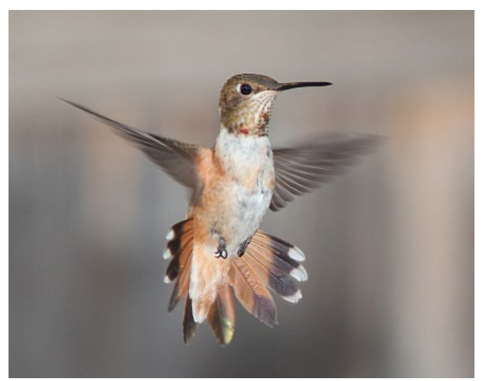
Garden seeds available at ufseeds.com

Since hummingbirds aren't cavity nesters, they will build nests out of lichen, feathers, moss, spider silk and other materials. Make your yard nest-friendly for hummingbirds by making sure there's a food source and also making sure there is shelter such as trees with perching spots and plenty of shrubs. Water, such as misters or bubblers, also makes the yard more attractive to hummingbirds. Another way to attract hummingbirds to your garden is implementing the color red. If you want to encourage nesting, try not to post up too many hummingbird feeders because it will bring too much competition for birds to nest comfortably.