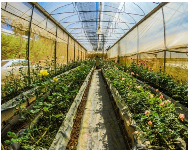
Vegetable seeds available at ufseeds.com

Check out everything you need to get started at <u>ufseeds.com!</u>