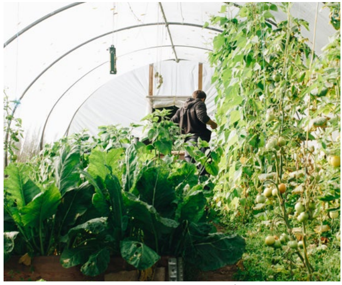
Vegetable seeds available at ufseeds.com

Not only does a greenhouse increase the growing season, but it also can help increase the quality of the vegetables you're growing. If you're creating optimum growth conditions for your plants, then clearly the plants will produce more and higher quality fruit. Once you get the operations of a greenhouse down, you can provide just the right amount of water, heat, shade and light to foster the best growing environment for the plants.