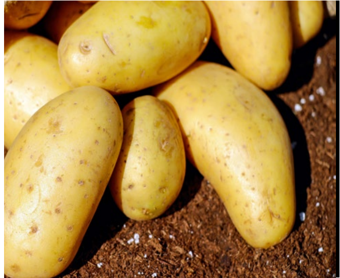
Seed potatoes available at ufseeds.com

Seed potatoes should have at least one or two sprouts, or eyes, on them, and larger potatoes with three or more sprouts can be cut in half. Cut seed potatoes in 1-inch pieces. Once the seed potatoes have been cut, give them enough time to callous, generally 10 to 14 days. If the seed potatoes haven't healed prior to planting, the wetness of spring can cause them to rot. To quicken the healing process of freshly cut seed potatoes, you can apply sulfur to the flesh. Sprinkle the sulfur onto the cut potatoes and lay the potatoes out in a single layer in a warm, humid location to dry for a few days. Most often, a paper bag